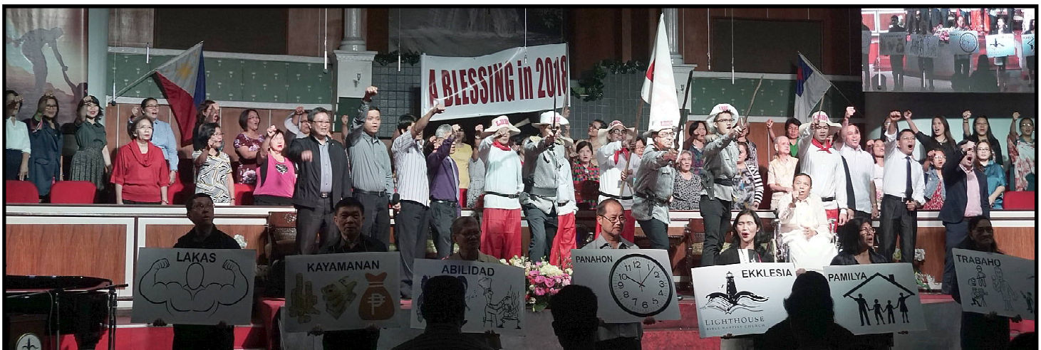
With hands raised, the adults of Lighthouse BBC, appear very determined into being a blessing in their presentation last Sunday night. Praise God for the hearts of our adults!