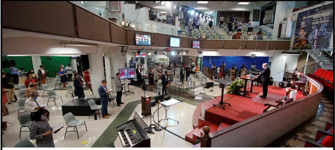
On-site attendance was adjusted last Sunday by the Lighthouse Protocol Committee as Covid19 cases around the country continue to decrease. Today, as Alert Level 2 takes effect, on-site attendance is even more increased in Lighthouse BBC. Safety precautions however continue to be in effect.

This pandemic has made us to realize that we can actually "do exceeding abundantly above all that we ask or think, according to the power that worketh in us." Let us therefore, through this workshop, see how the Lord Jesus Christ works in us. - PRA