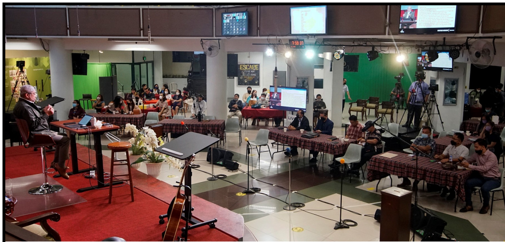
Pastor Reuben is seen in this picture conducting the Ministries Workshop 2022 on-site and on-line last week. About 300 key members of various Lighthouse BBC related works joined the 2-night worthy event. The workshop is a regular annual activity every 1st quarter.