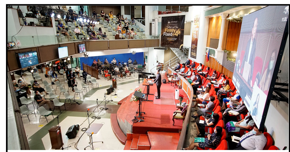
This is another view of the beautiful on-site attendance last Sunday, with the Lighthouse BBC Choir occupying the choir loft. This should "provoke" everyone to be present.

Eph 5:19-20, "Speaking to yourselves in psalms and hymns and spiritual songs, singing and making melody in your heart to the Lord..." - end -