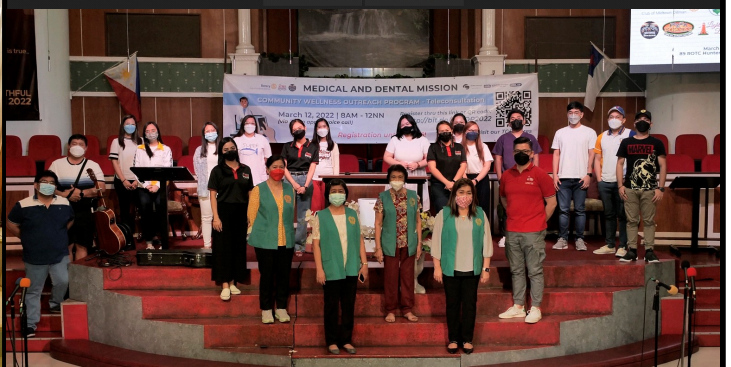
Left picture, the 250-voice joint Lighthouse BBC choir, along with the 40-member LCO record their number last Sunday night. Top and bottom right pictures, the CWOP TeleConsultation on-site and on-line teams pose for their picture after the worthy event yesterday.

"Unto Him be glory in the church by Christ Jesus throughout all ages, world without end. Amen" (Eph. 3:21)