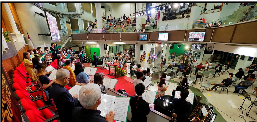
This picture tells much of the readiness of the Lighthouse BBC for the much-awaited 46th Anniversary and Sacrificial Celebration next Sunday, March 20. Everyone looks forward to the Coming Together.