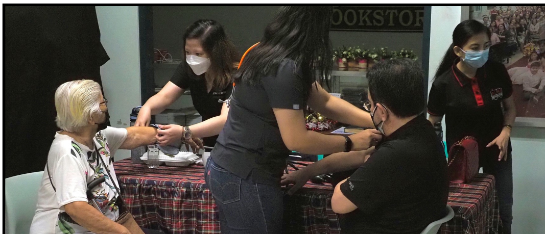
Above scene comes to mind as booster vaccines are extended to eligible Lighthouse BBC members this afternoon from 1pm to 3:30pm, just before the All Lighthouse Coming Together in cooperation with DOH QC Health Office. Above picture was from the Vaccination Drive last Dec 18, 2021.

Lighthouse BBC indeed is a church where the doctrines and practices of the New Testament Churches are clearly being seen. This ought to be so because they are actually the ones in which we are patterned after.