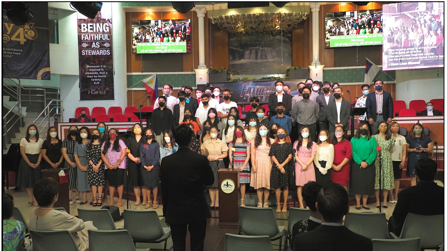
The Lighthouse Youth Fellowship and the Single Working Young People joined together to sing the song, "I Have Been Blessed" as a treat to fathers as they were given recognition and honor last Sunday. It was thrilling to finally see some presentations made physically.

"Unto Him be glory in the church by Christ Jesus throughout all ages, world without end. Amen" (Eph. 3:21)