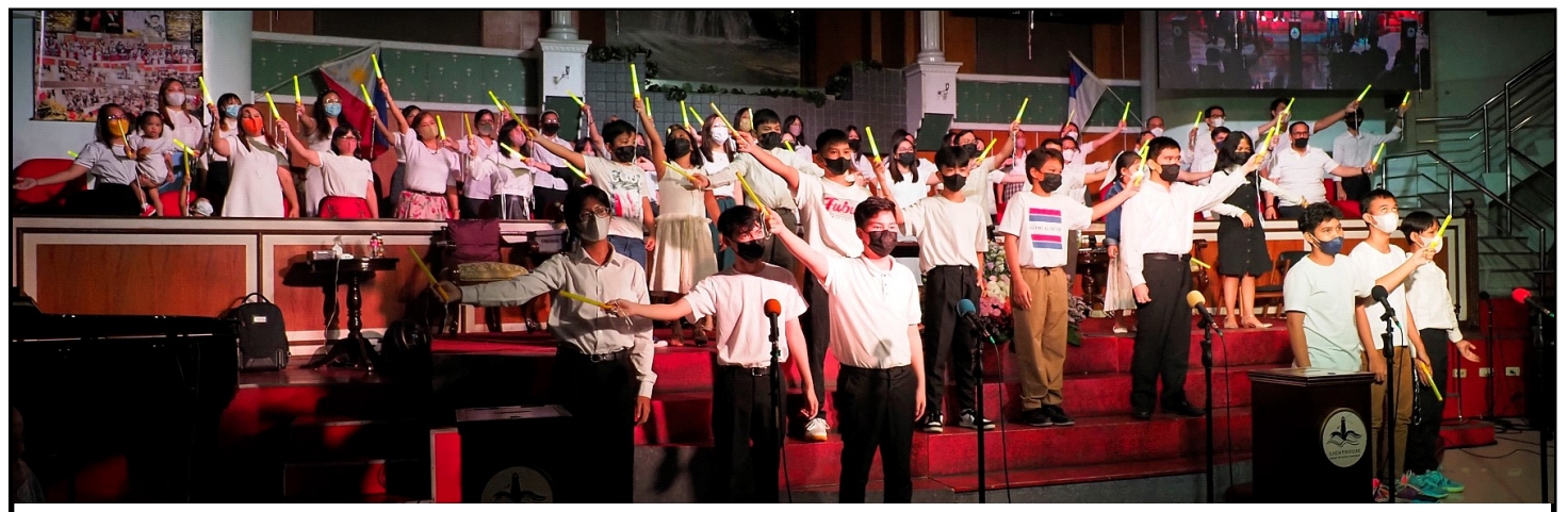
It was a thrilling experience, a real big blessing to once again see the presentations of our Lighthouse Districts as the Friends of Lighthouse Districts (FOLD) started last Sunday with LD1's excellent presentation. They also brought their friends for them to witness God's grace!