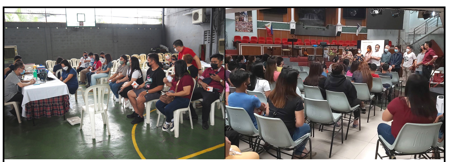
It was a busy day yesterday at Lighthouse BBC as several functions happen all at the same time, which include the Blood Letting Drive and the Lighthouse Academy Orientation. Not in picture were the Legal Aid Clinic, the Mga Munting Ilaw shoot and Baptist Riders United meeting.

2 Peter 3:12-14, "Looking for and hasting unto the coming of the day of God, wherein the heavens being on fire shall be dissolved, and the elements shall melt with fervent heat? ... Wherefore, beloved, seeing that ye look for such things, be diligent that ye may be found of him in peace, without spot, and blameless." - end -