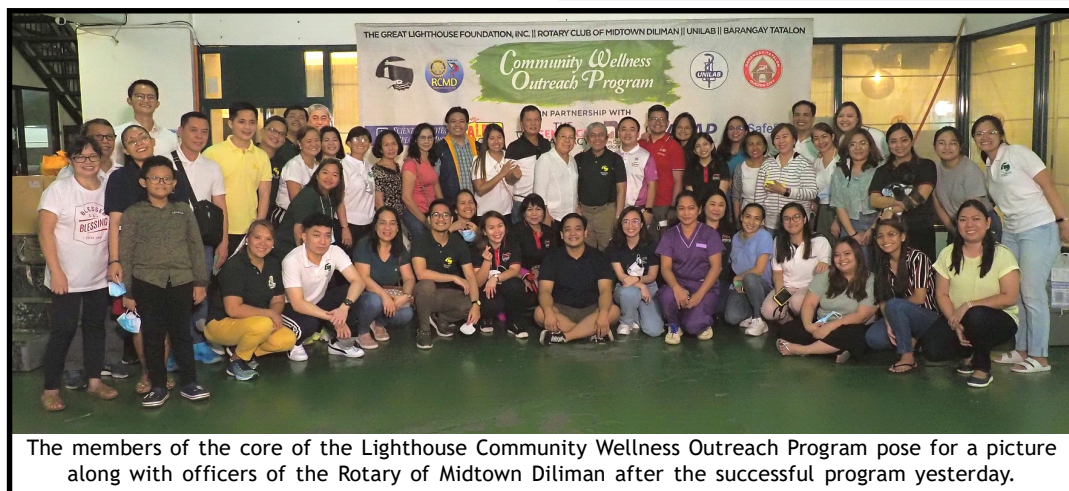
The members of the core of the Lighthouse Community Wellness Outreach Program pose for a picture along with officers of the Rotary of Midtown Diliman after the successful program yesterday.