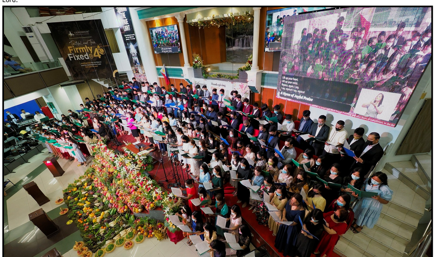
This is a beautiful scene showing the joint 180-voice choir, with the altar filled with colorful decoration of fruits, the LED monitors and banners during the eventful Lighthouse Coming Together for Thanksgiving Firstfruits last Sunday, Sept 18.

E) Knowledge, wisdom and understanding of His purpose in us. Col 1:9-12, "For this cause we also, since the day we heard it, do not cease to pray for you, and to desire that ye might be filled with the knowledge of his will in all wisdom and spiritual understanding; that ye might walk worthy of the Lord unto all pleasing, being fruitful in every good work, and increasing in the knowledge of God; strengthened with all might, according to his glorious power, unto all patience and longsuffering with joyfulness; giving thanks unto the Father, which hath made us meet to be partakers of the inheritance of the saints in light..." - to be continued -