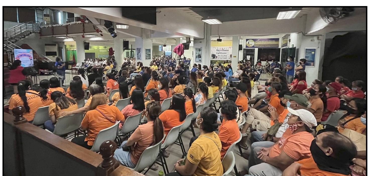
About 300 Solo Parents from Barangay Tatalon, together with key leaders held a General Assembly. Lighthouse BBC extends to these solo parents the ministry that involves weekly Bible Studies, counseling and various activities that help their whole being. Praise God that Lighthouse BBC continues to shine the true light of Jesus Christ to our community.