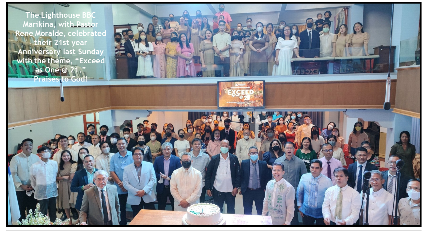
"Unto Him be glory in the church by Christ Jesus throughout all ages, world without end. Amen" (Eph. 3:21)

Matthew 23:12 And whosoever shall exalt himself shall be abased; and he that shall humble himself shall be exalted." - to be continued -