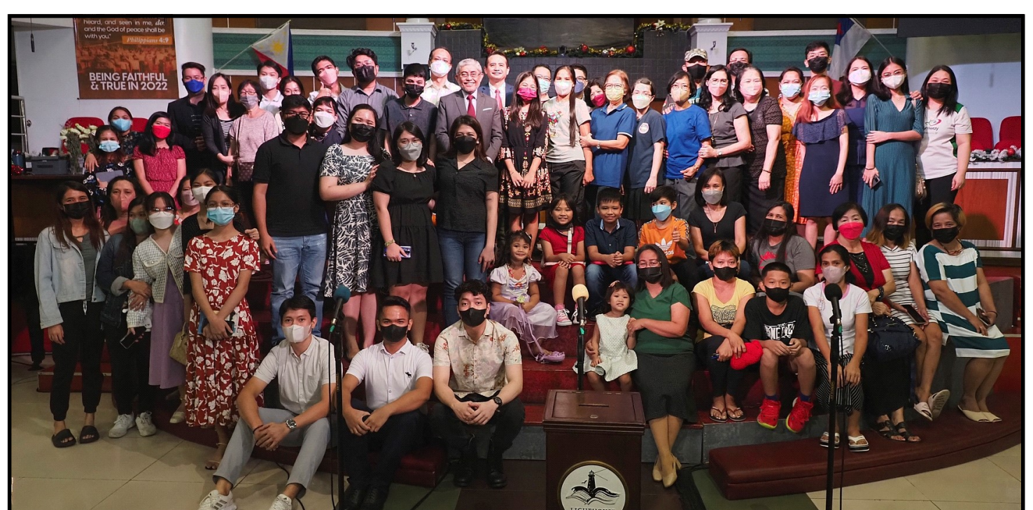
The Lighthouse District 4 pose for a picture along with their friends and visitors. The Friends of Lighthouse Districts (FOLD) has become an opportunity for members to bring friends and visitors. They see the beautiful involvement of each in the work.