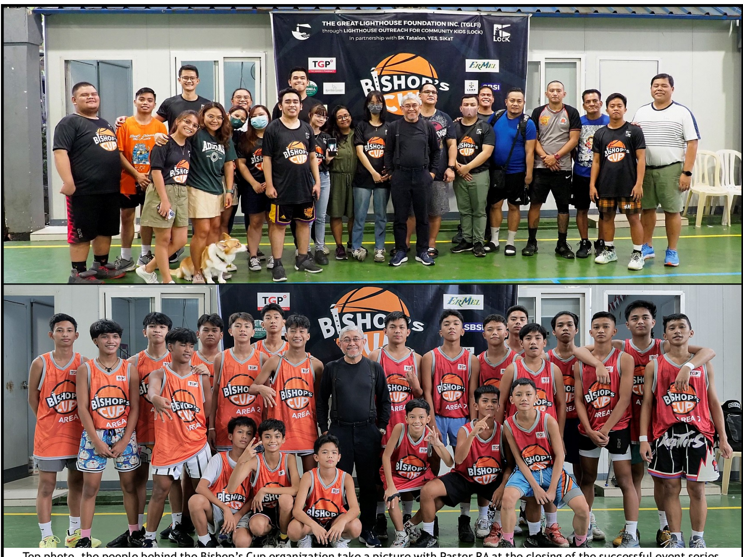
Top photo, the people behind the Bishop's Cup organization take a picture with Pastor RA at the closing of the successful event series. Lower photo, the Tatalon Area 2 and Area 7, the two teams that entered the championship round take a picture before the game.

Phil 2:15-16, "That ye may be blameless and harmless, the sons of God, without rebuke, in the midst of a crooked and perverse nation, among whom ye shine as lights in the world; holding forth the word of life..." - to be continued -