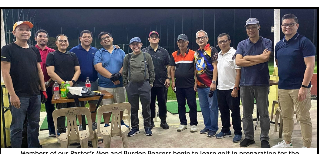
Members of our Pastor's Men and Burden Bearers begin to learn golf in preparation for the Lighthouse Open Golf Tournament on Feb 17 at the Forest Hills Golf and Country Club in Antipolo. This tournament is for the benefit of The Great Lighthouse Foundation Inc.

This is what we should know of the grace of God as we prepare for our coming anniversary and sacrificial celebration. - PRA