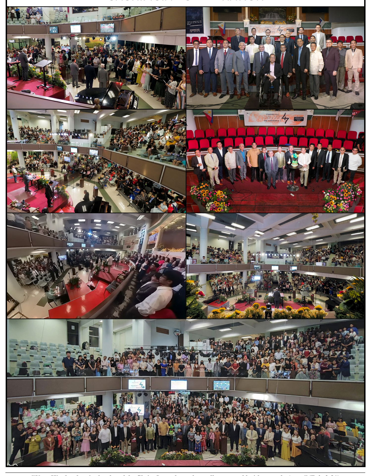
"Unto Him be glory in the church by Christ Jesus throughout all ages, world without end. Amen" (Eph. 3:21)