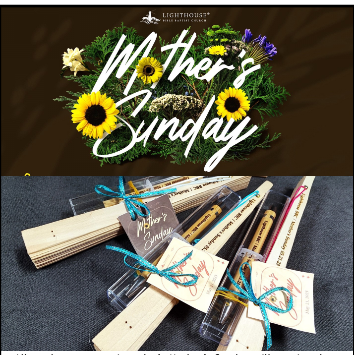
All mothers present in today's Mother's Sunday will receive these beautiful tokens: a native hand fan (pamaypay) and a pen.

"Honour widows that are widows indeed. But if any widow have children or nephews, let them learn first to shew piety at home, and to requite their parents: for that is good and acceptable before God" (1 Tim 5:3-4).