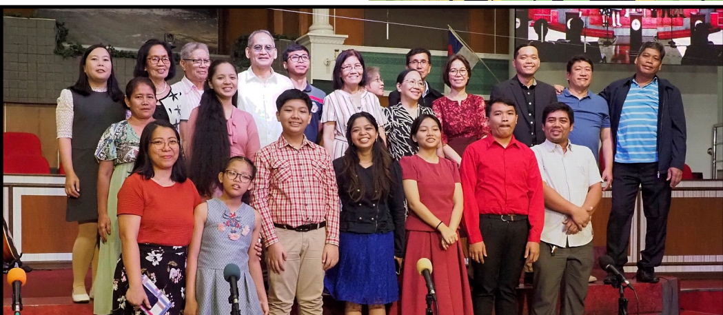
The Lighthouse District 3 members as they pose for a picture after their FOLD presentation last Sunday. The District did a silhouette play presentation.