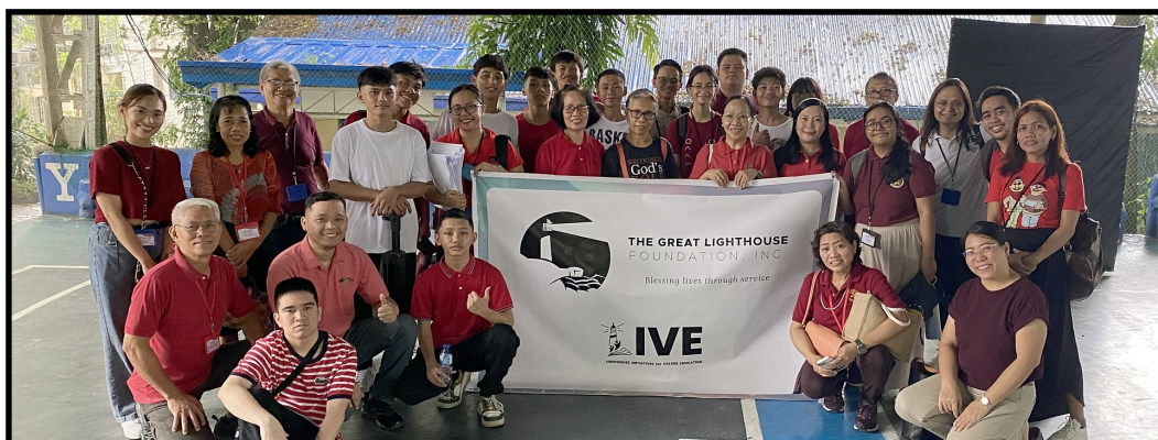
Teachers, Asst Teachers and Helpers from The Great Lighthouse Foundation who have been trained in PAGLIPAD take a photo after the launching of the Youth Development Curriculum in Antipolo National High School in Barangay Sta Cruz, Antipolo where an agreement was recently forged.

STANDING FAST, SERVING GOD AS FREE IN 2023