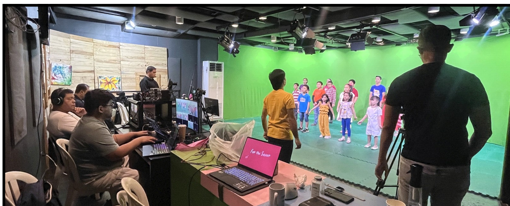
Photo shows the Mga Munting Ilaw (MMI) doing its recording at the GCTV Studio. The long-running Children's show is now seen both on TV and Radio over DZAS, 702kHz AM every Saturday, 10am.

STANDING FAST, SERVING GOD AS FREE IN 2023