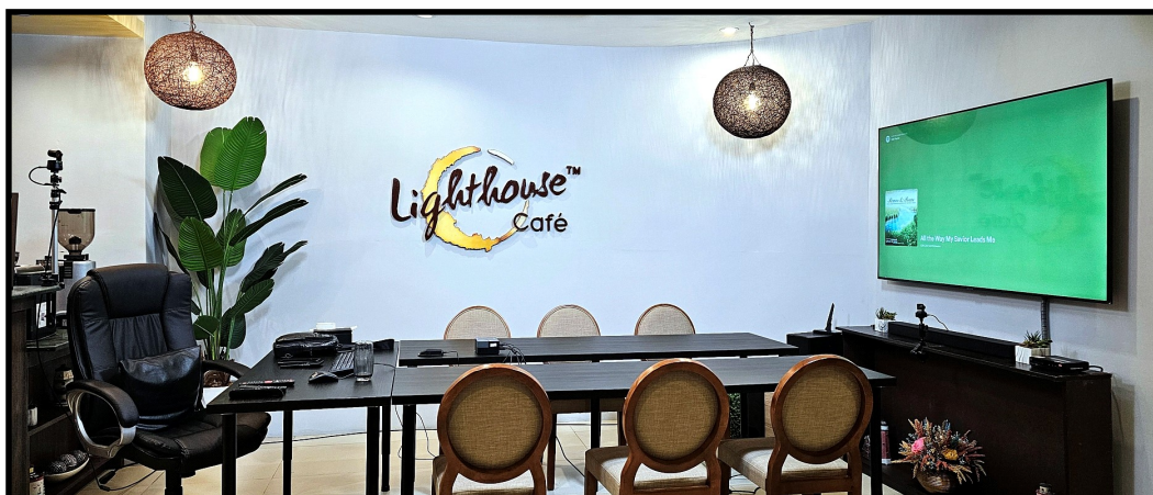
The Lighthouse Café now sports a new logo in wood carving and with enlarged space for media.

STANDING FAST, SERVING GOD AS FREE IN 2023