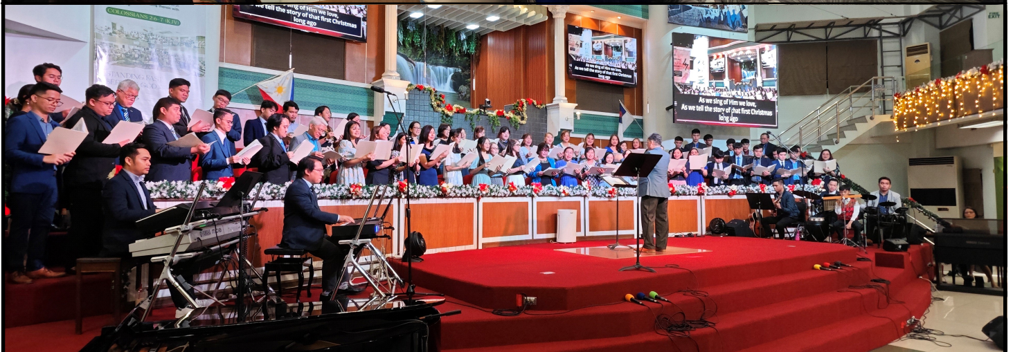
Top four photos, giving of gifts being extended to Solo Parents, to children in partnership with Operation Christmas Child (OCC), to communities by the Dept of Social Welfare and Development (DSWD) and children in partnership with MGC New Life Christian Academy. Lower photos, the Lighthouse BBC Choir as they presented the King of Kings Cantata. Picture also shows the LAVNet team handling the various technical systems during the Cantata night.

"Unto Him be glory in the church by Christ Jesus throughout all ages, world without end. Amen" (Eph. 3:21)