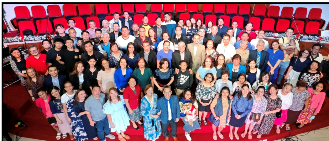
Key Lighthouse BBC Pastors, PMs, Sentinels, Fellowship Leaders and Ministry Personnel pose for a group picture after the Night of Good Tidings and Great Joy Coming Together last Thursday. A joyful celebration of the birth of the Lord Jesus Christ to everyone!

The birth of the Lord Jesus Christ is not just a verbal message of good tidings and great joy for all people - not one that is empty of bringing all the sense of "healing" to the brokenhearted, "recovery" to those who are blinded to the grace