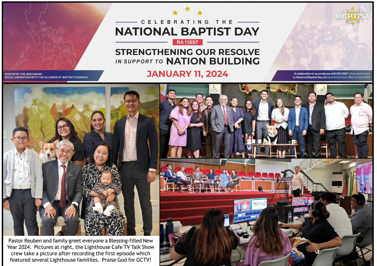
"Unto Him be glory in the church by Christ Jesus throughout all ages, world without end. Amen" (Eph. 3:21)

LIGHTHOUSE PASTORS AND PREACHERS, PMs, LEADERS AND CHURCH STAFF ARE ENJOINED TO BE AT THE BIBLEMODE CONFERENCE THIS WEEK AT MBBE.