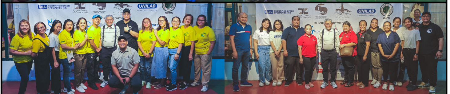
Top photo, a portion of the more than 400-strong manpower take a group photo before the start of yesterday's Community Wellness Outreach Program (CWOP). Second row photos, Clockwise from left: the LOCK team, Burden Bearers, ALERT, Pharmacy Team, Food Committee and Counseling Team. 214 personnel made up the teams from Lighthouse and 217 came from various partners. Praises to God for His Manifold Grace in His people!

"Unto Him be glory in the church by Christ Jesus throughout all ages, world without end. Amen" (Eph. 3:21)